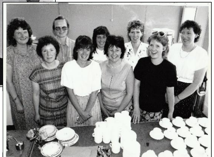
Top : The popular Tombola stall Centre: The concert production crew. Right: Cheerful tea ladies!