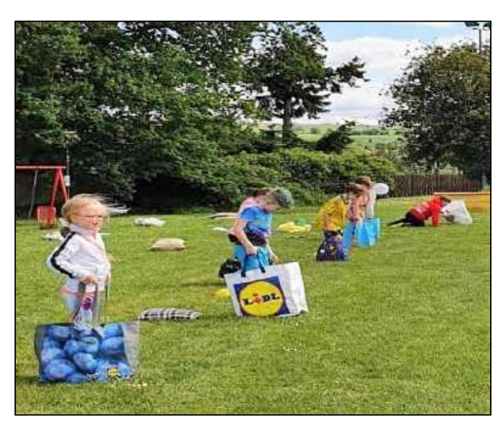
Because of the school closures, sports days were cancelled. However, a group of enterprising mums held a social distancing sports and games afternoon. Looks like everyone had a great time. Well done kids . . . and, of course mums!