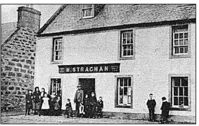
Maryburgh shop and post office