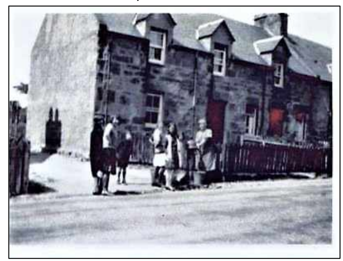
Hermanville, outside which stood the village pump where residents would gather to fill buckets and have a "bleather".