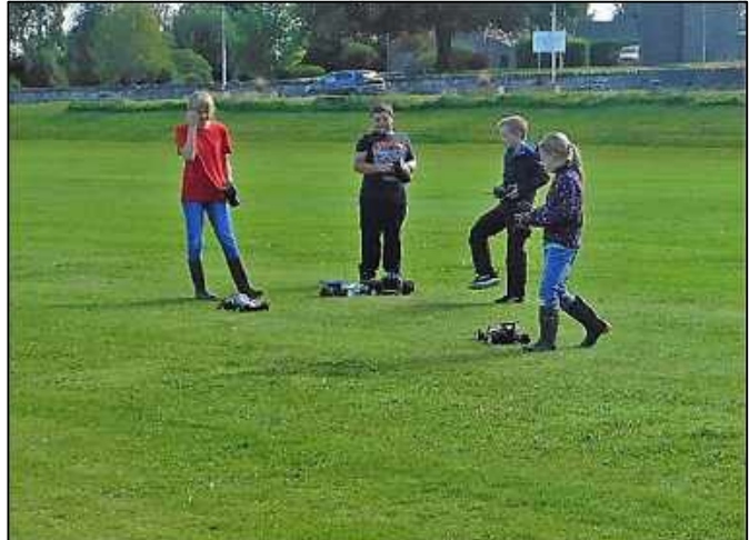
The Radio Controlled Car Club have been meeting outdoors on the sports pitch from 3pm - 6pm on Sundays. Why not pop along and give it a go? Information on cost etc is on P5.