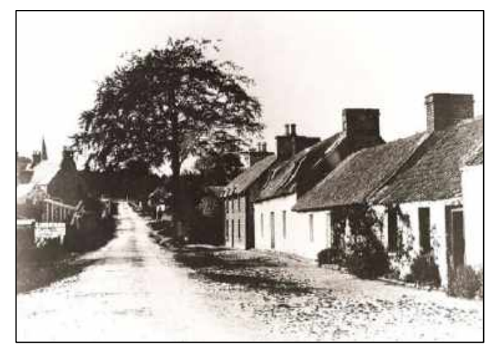
Hood Street. The tall tree marks where the school garden was.